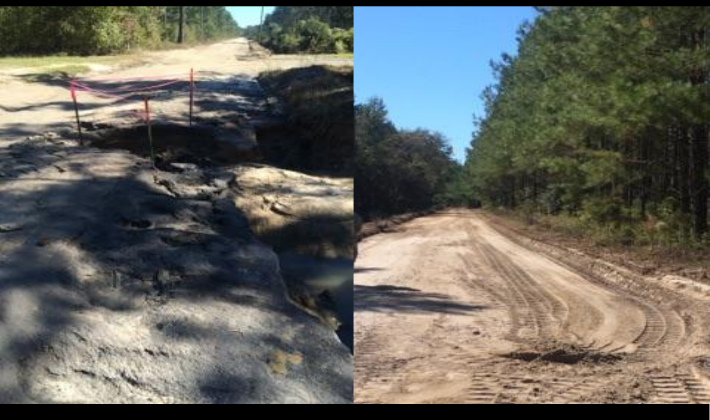
TF 130 / 16-327 - Dave Plowden Rd. - Clarendon County