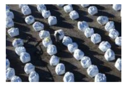
More than 7,000 one-ton filled sandbags were transported.