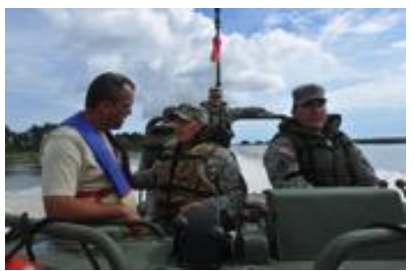
11 Lives were saved by boat rescue.