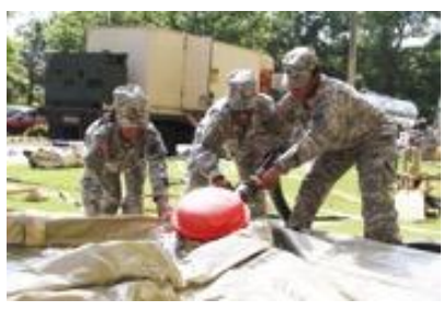
1.8 million gallons of water were purified and provided to support three hospitals in Columbia.