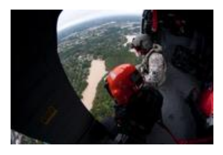
28 Lives were saved by Helicopter Aquatic Rescue Teams.