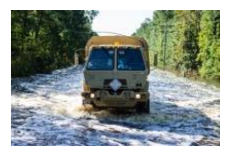
170 lives saved and more than 3,000 evacuated by High Water Vehicle Transport.