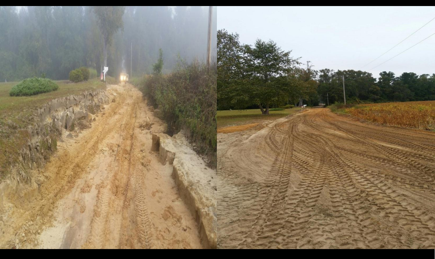
16-304 - Gibbons Road - Clarendon County