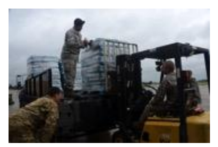
More that 70,000 bottles of water were transported to 19 distribution points.