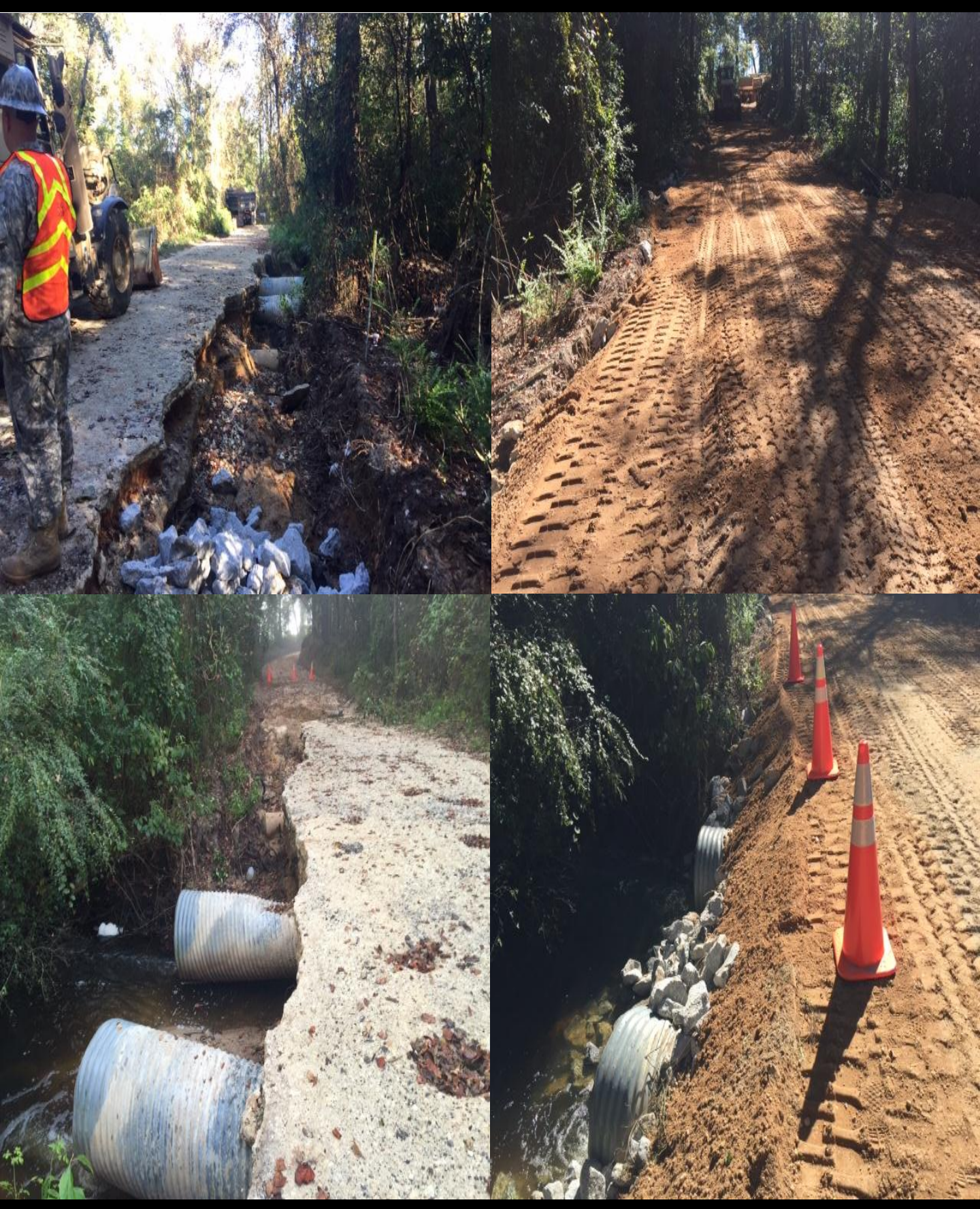
16-357D – Fairfield Road – Clarendon County