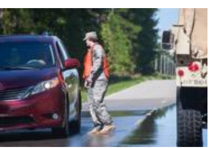
138 Traffic Control and Security Points were staffed.